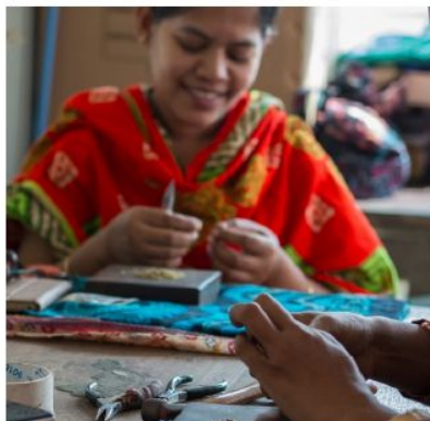
Teaching women a trade.

Is God speaking to your heart about the Muslim people in India? Guwahati offers a unique opportunity to reach three major people groups, mobilize and train locals, and get involved in social justice issues.