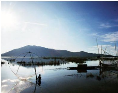
"Guwahati" means "place of sunrise."

Since tribal rebels are organized and fighting for political autonomy, a peace-making and justice element of society transformation will be important.