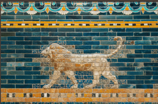
The Lion of Babylon depicted on the Ishtar Gates of Babylon.

Is God calling you to live among the Muslim peoples of the Middle East? Contact us. We would love to help you get there!