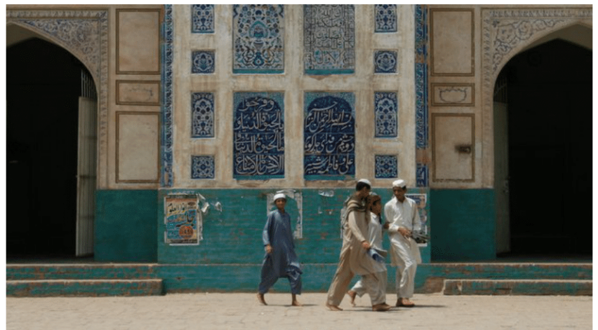
Madrassa students returning from prayers at one of Multan's mosques

Gospel resources : Bible (Urdu), Jesus Film, satellite TV programs, Internet, mobile media with Bible stories and studies.