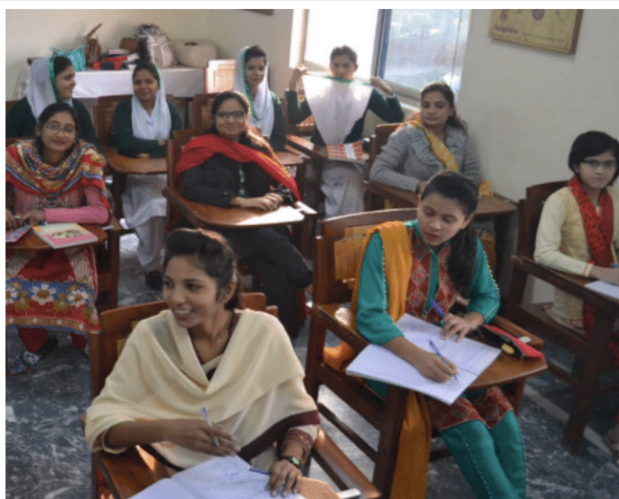
A group of midwifery students prepare for morning class

- Thank God for the improved law and order situation in Multan, and pray for increased boldness for witness among national believers.