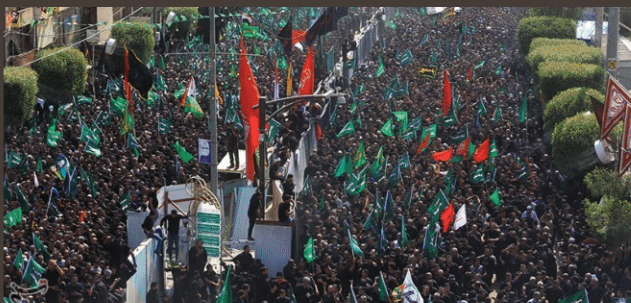
The Shia Pilgrims on their walk towards Karbala, the 40 days after Ashura.

Is God calling you to live among the Muslim peoples of the Middle East? Contact us. We would love to help you get there!