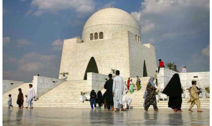
The mausoleum of Pakistani's founder, Muhammad Ali Jinnah, in Karachi

“for a wide door for effective work has opened to me, and there are many adversaries.”