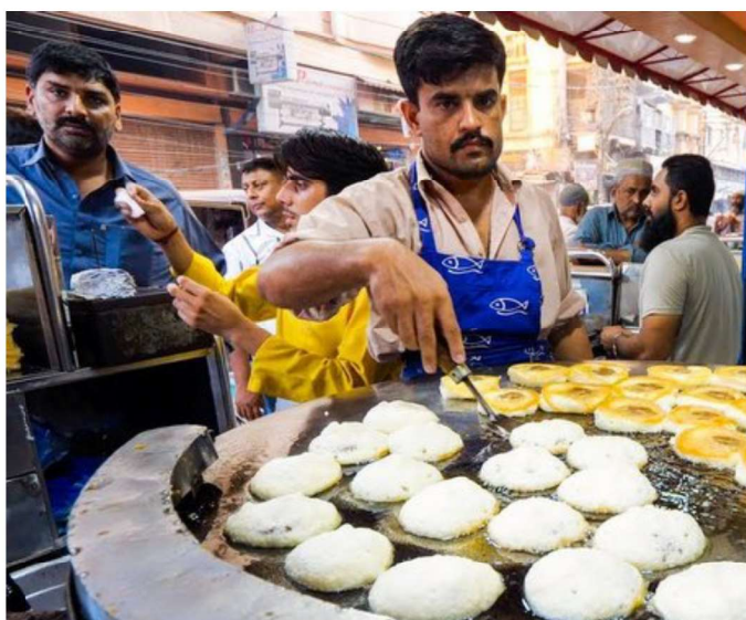
Street food vendors are a common sight in Karachi

- It is estimated that as many as 45,000 migrant workers come to Karachi each month. Pray that they may come to faith and grow in Jesus Christ and take the gospel message back to their home communities.