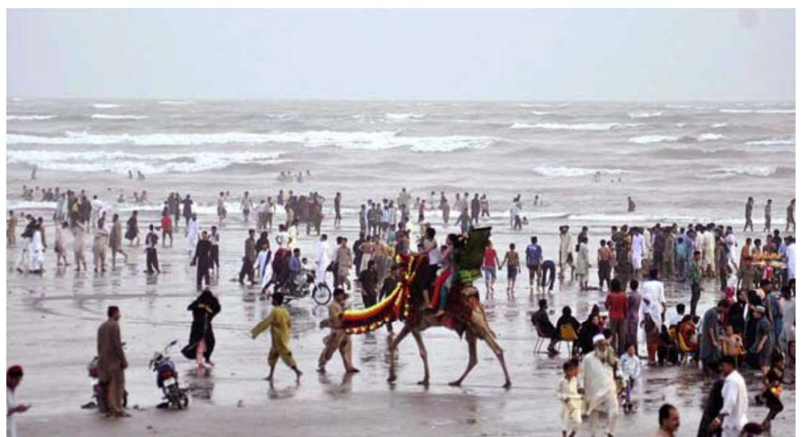
Clifton Beach is a popular recreation site for a mix of Karachiites

Gospel resources : Bible translations, Jesus Film, radio and TV broadcasts, mobile media, local churches